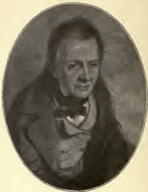
Thomas Dr. Quincey.